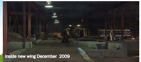
Inside new wing December 2009