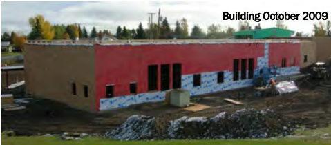
Building October 2009