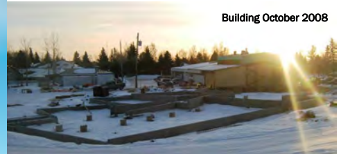
Building October 2008