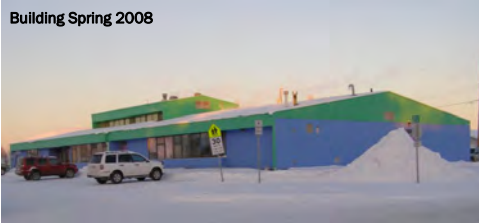
Building Spring 2008

It is with great appreciation and humility that we extend our thanks to the many individuals and businesses that have supported us throughout this past year. As an organization that is dependant on community investment in order to maintain a high level of service to children with special needs and their families, we are at awe that no matter the financial climate, our community stands behind the work we do!